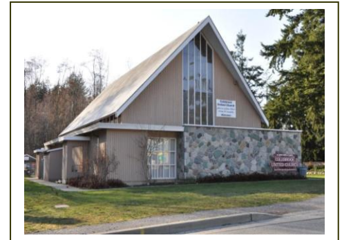
Colebrook United Church

Something essential or trivial for everyone! Have any “treasures” to donate? Please call after April 21 to confirm someone will be available to receive them – 604-596-2412.