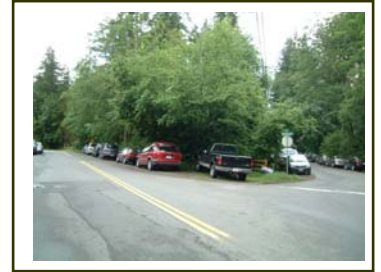
Future traffic circle at Station Rd and 125A St

With the house removed, we'll see how quickly the development proceeds.