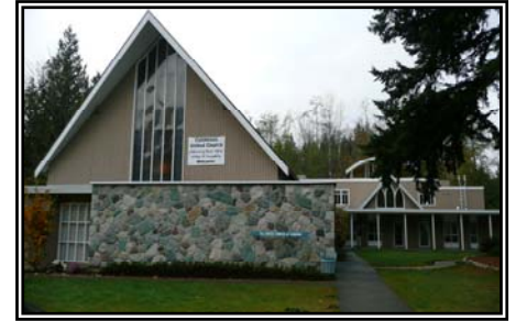
Colebrook United Church

Celebrate Christmas -watch for church signs and service times.